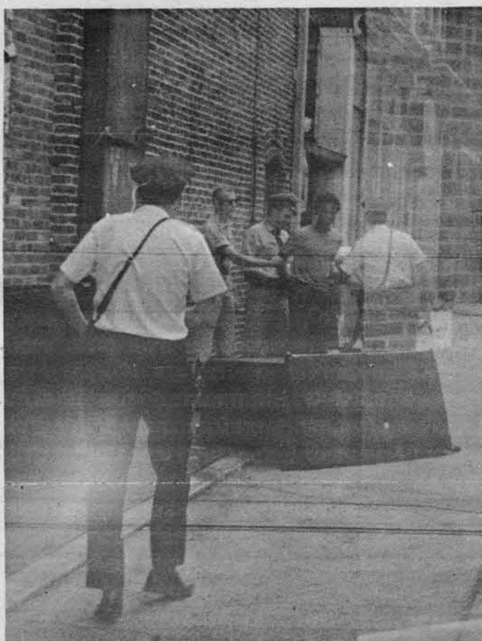
Walking down the "Avenue" can get you arrested in Baltimore.

At approximately 3:30 p.m. the tactical squad and the narcotics squad