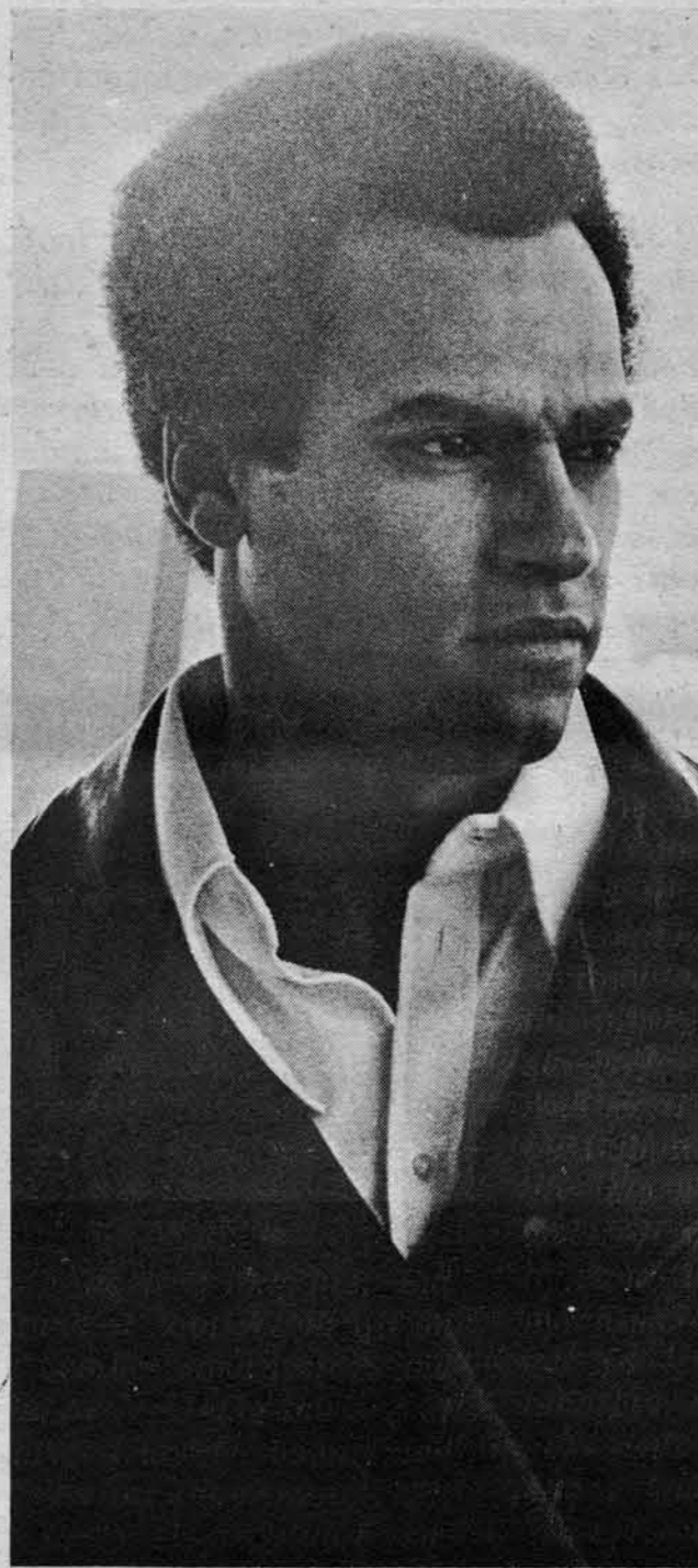
HUEY P. NEWTON MINISTER OF DEFENSE BLACK PANTHER PARTY