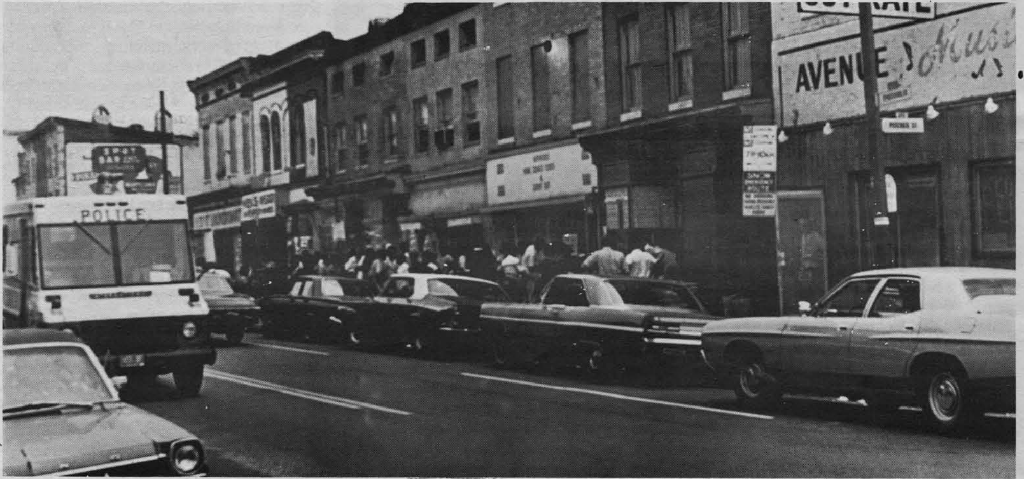
All that's missing is the barbed wire.