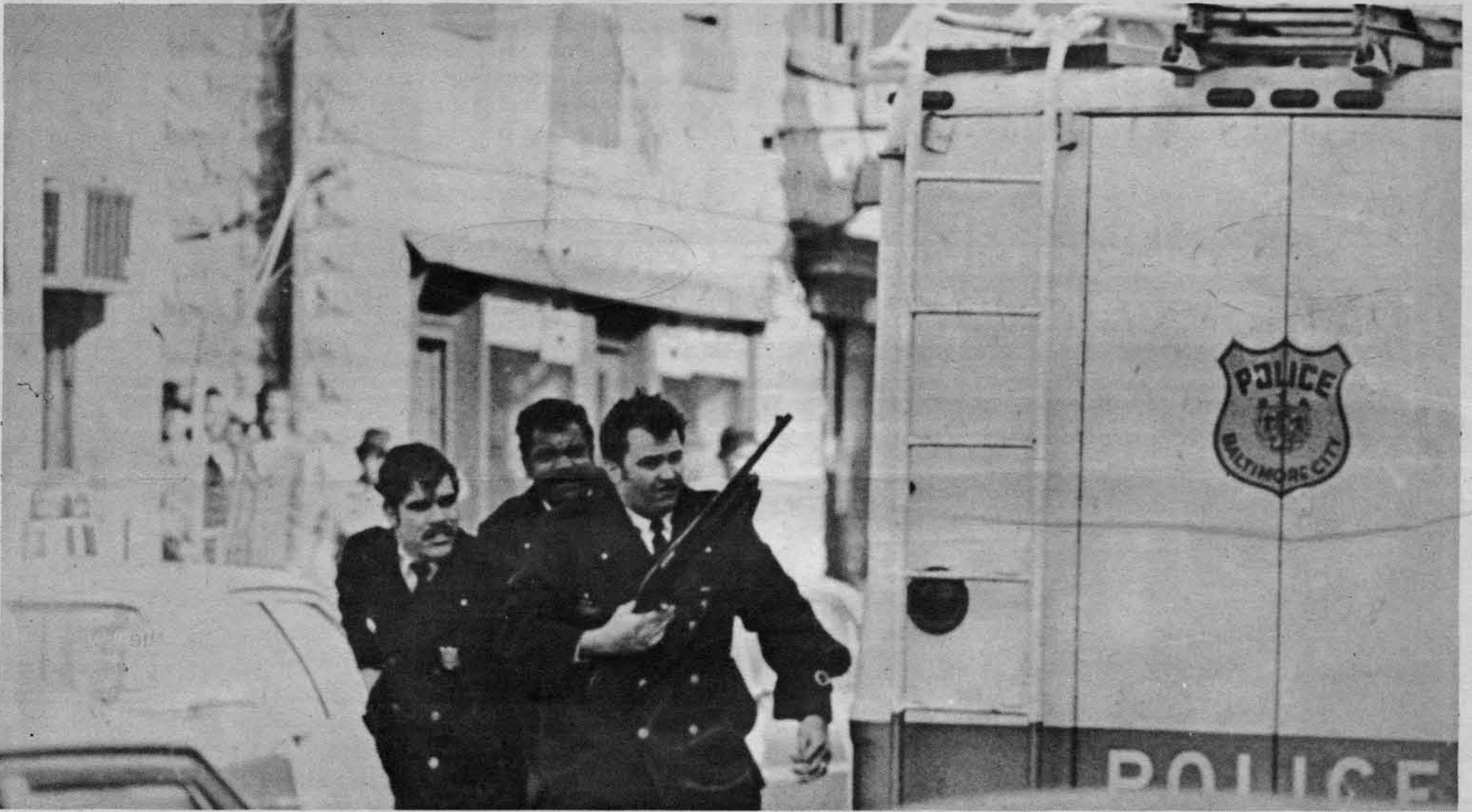
Baltimore Pig Department's Tactical and Narcotics Squads tried to arrest everyone in the Black community, young and old.