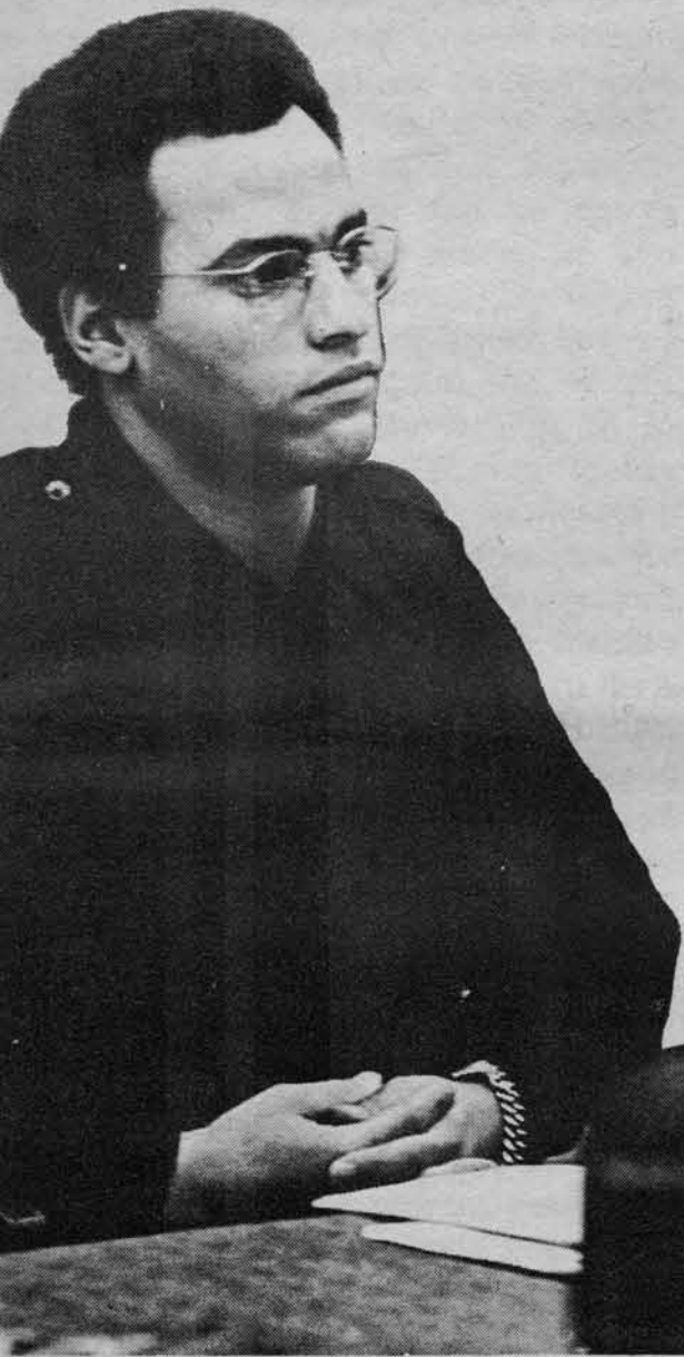
HUEY P. NEWTON

In the trial of Huey P. Newton, the Minister of Defense of the Black Panther Party, the Prosecution closed its case, having proven only that Huey was stopped by Oakland police, harassed, shot by them, mistreated at a hospital and eventually arrested and taken to jail for murder and attempted murder